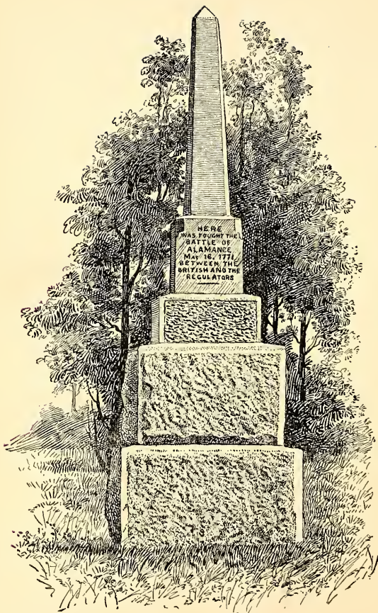
MONUMENT ON ALAMANCE BATTLE-GROUND.